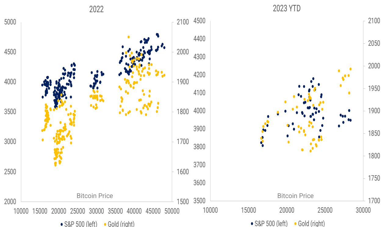
Figure 3 – Bitcoin Tethered Gold, Not Stocks